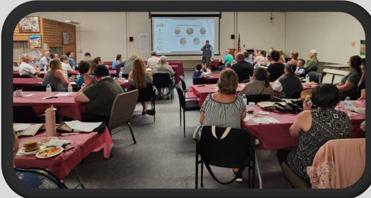
THE CATERERS GONE LOCO CAFÉ AT NO VIEW FARM