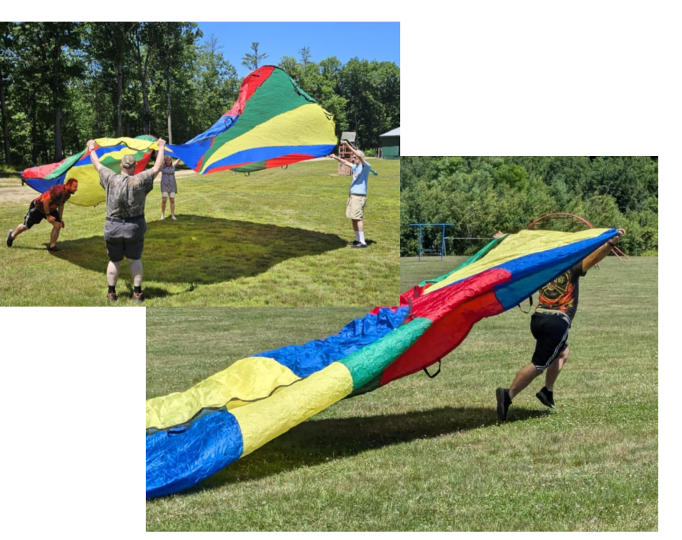
Having fun with the parachute at the Mexico Rec Park