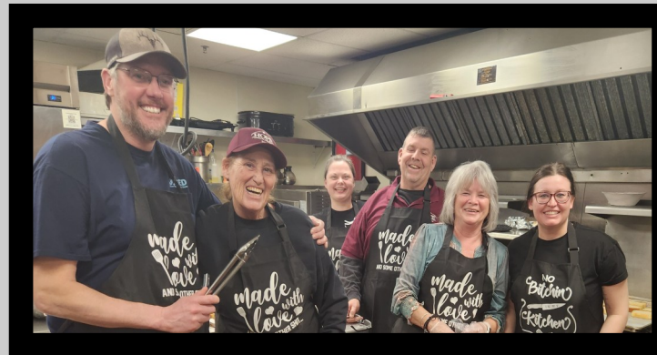
Meet our kitchen crew from the Noel & Fawn Fundraiser dance for Hope Association.

They cooked up a delicious million dollar spaghetti dinner that was enjoyed by all.