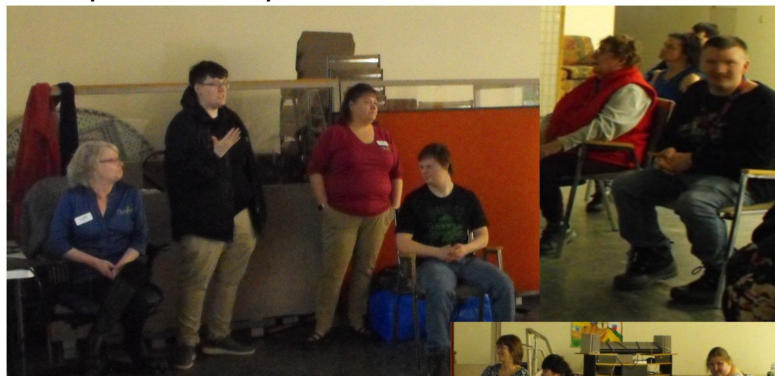
Oxford Federal Credit Union visits to discuss banking and financial literacy